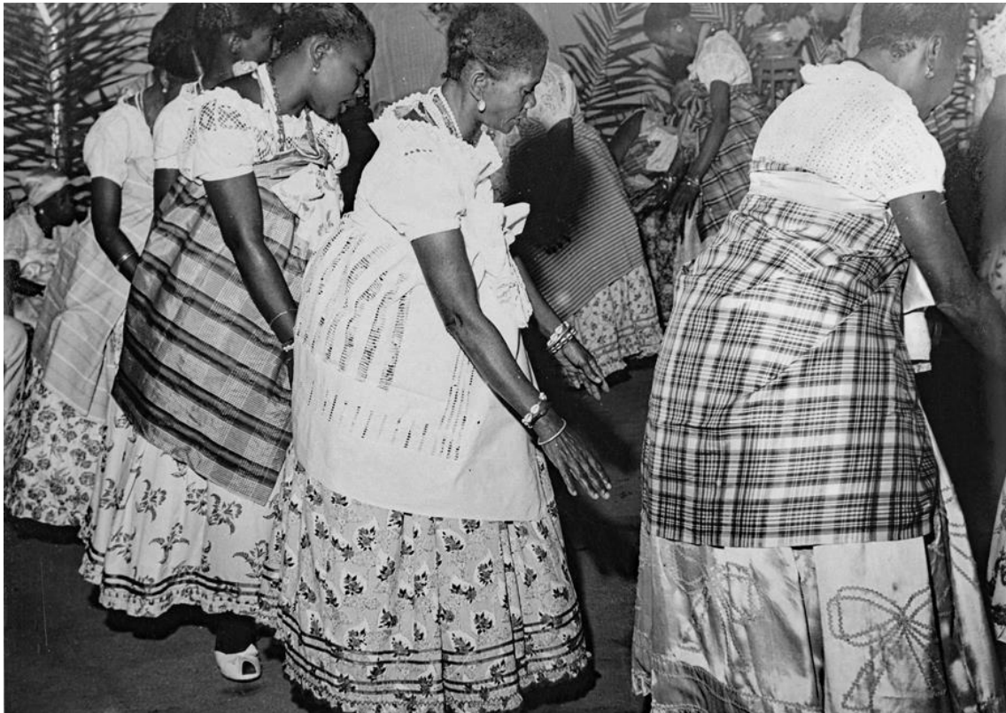
Figure 2. “Candomblé in Bahía (Brazil), a Ritual Dance,” photographed in 1962 in a public history project sponsored by the Organization of American States. This image shows a group of women in traditional dress of African heritage engaged in dance as part of Candomblé religious ceremonies.

Indigenous Tupi-Guarani people of Brazil possessed religious beliefs concerning ancestor spirits that blended readily with BaKongo and Yoruba concepts of powerful spirits and sub-deities (Genovese 1976; Orser 1996; Sturm 1977). As in Vodou in Haiti, Macumba and Candomblé in Brazil developed with a rich complex of iconography, ritual performance, and temple spaces, and have expanded within the nation to this day.