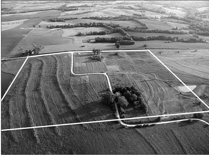
Figure 2: Aerial view of New Philadelphia National Historic Landmark site with town plat boundaries highlighted.

Photograph courtesy Dr. Tommy Hailer; overlay by C. Fennell.